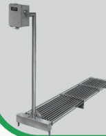
Over the Side Heaters