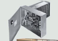
QUA Sip-In Duct Heater