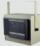
UHP Series Confined Space Unit Heaters