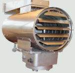
Compact Explosion-Proof Unit Heaters