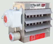
Ultra-Safe Explosion-Proof Heaters